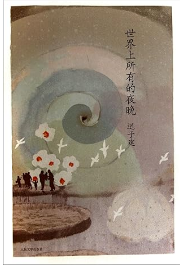
All Nights in the World by Chi Zijian via Amazon

Sun's paper, "Challenging Polyphony's Role in Addressing Trauma and Mental Stress in Contemporary East Asian Women's Literature," centers on Mikhail Bakhtin's concept of polyphony—the coexistence of multiple, equal voices in a narrative. Exploring this idea, she employs a critical view of Chi Zijian's novella All Nights in the World for its attempt but ultimate failure to achieve polyphony, noting how this failure exacerbates the marginalization of rural women. The dominant narrative voice restricts, rather than empowers, the marginalized voices it seeks to elevate, perpetuating systems of suppression. The analysis underscores how well-meaning literary works in contemporary China can falter when the author's social stances and focus on collective trauma dilute the representation of individual women's domestic and mental struggles.